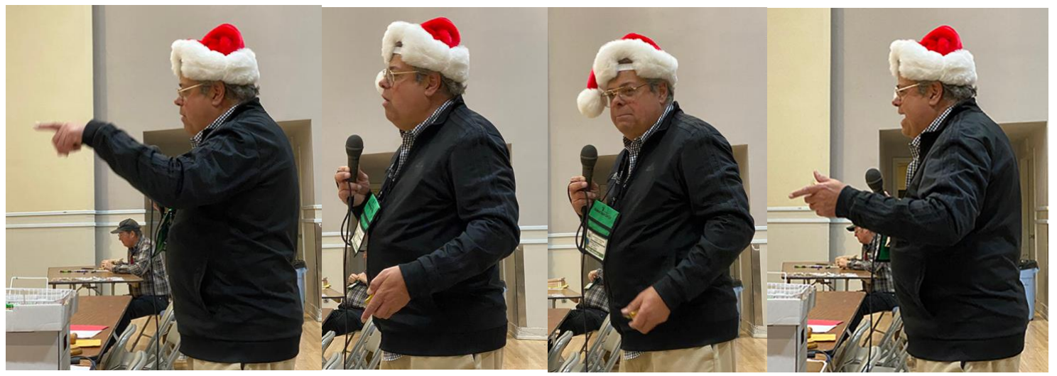
You better watch out,