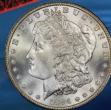
1884 $1 Morgan Dollar CACG MS67 $6,800