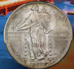
1917 25¢ Standing Liberty Quarter Type I CACG/CAC MS66FH $2,950