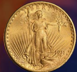
1911-S $20 St. Gaudens Double Eagle PCGS/CACMS65+ $13,000

2299 Lombard St., San Francisco, CA 94123 Wittercoin.com sales@wittercoin.com