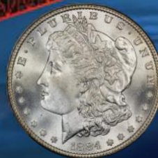
1884 $1 Morgan Dollar CACG MS67 $6,800