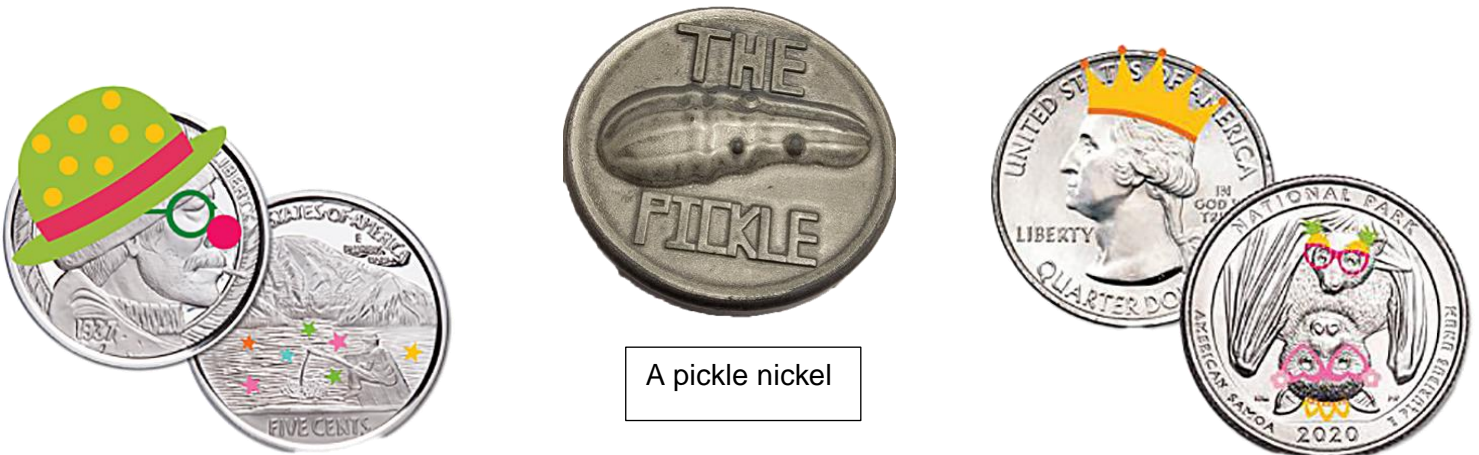
A pickle nickel

As always- bring in your item, give a talk, and get four free raffle tickets . And don't forget to send photos of your item(s) to newsletter@redwoodempirecoinclub.com ahead of time so they can be prepared for a slide show for viewing at the next meeting.